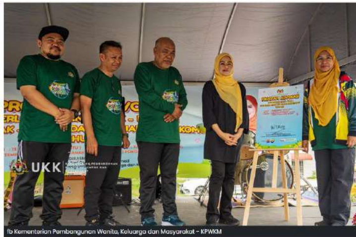
fb Kementerian Pembangunan Wanita, Keluarga dan Masyarakat - KPWK

ALOR SETAR, 13 Sept (Bernama) -- Kementerian Pembangunan Wanita, Keluarga dan Masyarakat (KPWK) terus memperkukuh perlindungan dan kesejahteraan kanak-kanak menerusi Program Advokasi Perlindungan Kanak-Kanak: KASIH Kanak-Kanak dan Jelajah Kasih Komuniti 2025 yang diadakan di Pusat Aktiviti Kanak-Kanak (PAKK) Pokok Sena, dekat sini, hari ini.