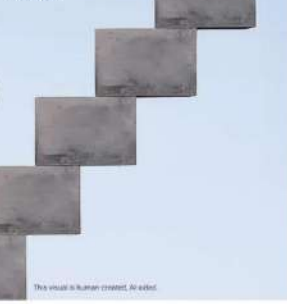
This visual is illustrative content.

There is an urgent need to have more inclusive employment policies to help women re-enter the workforce and reignite their careers.