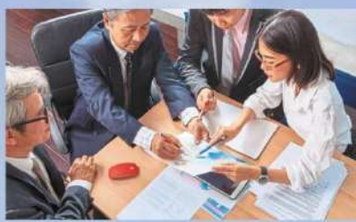
Trying to empower: The World Bank survey showed that firms are interested in employing more women but have low perceptions that they are 'costlier' hires.

TAJUK : BABY? PLEASE COME BACK! HARI : AHAD AKHBAR : SUNDAY STAR TARIKH : 14 SEPTEMBER 2025 M/SURAT : 12&13 STONE : NEUTRAL SEKTOR : KPWKM